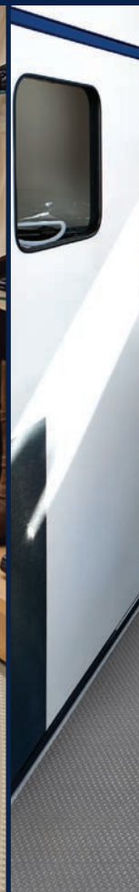
P716 Marlin Silver