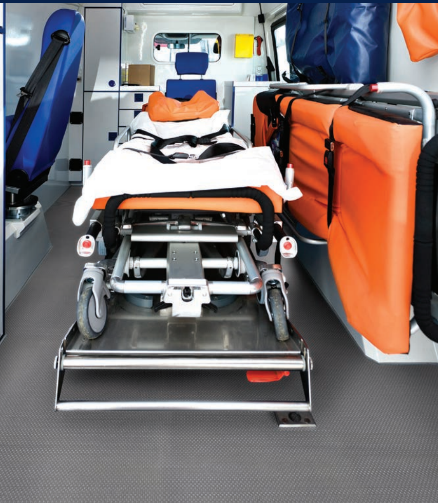
P717 Orca Blue