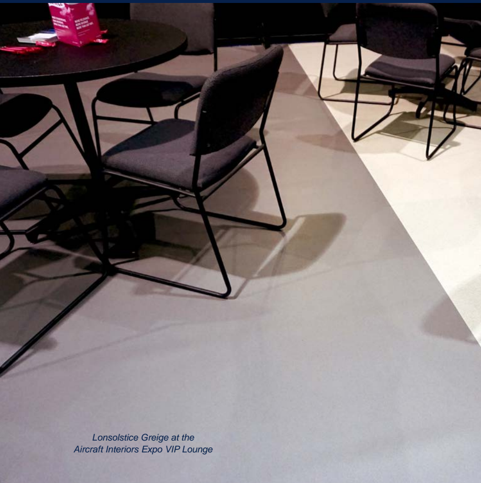
Lonsolstice Greige at the Aircraft Interiors Expo VIP Lounge